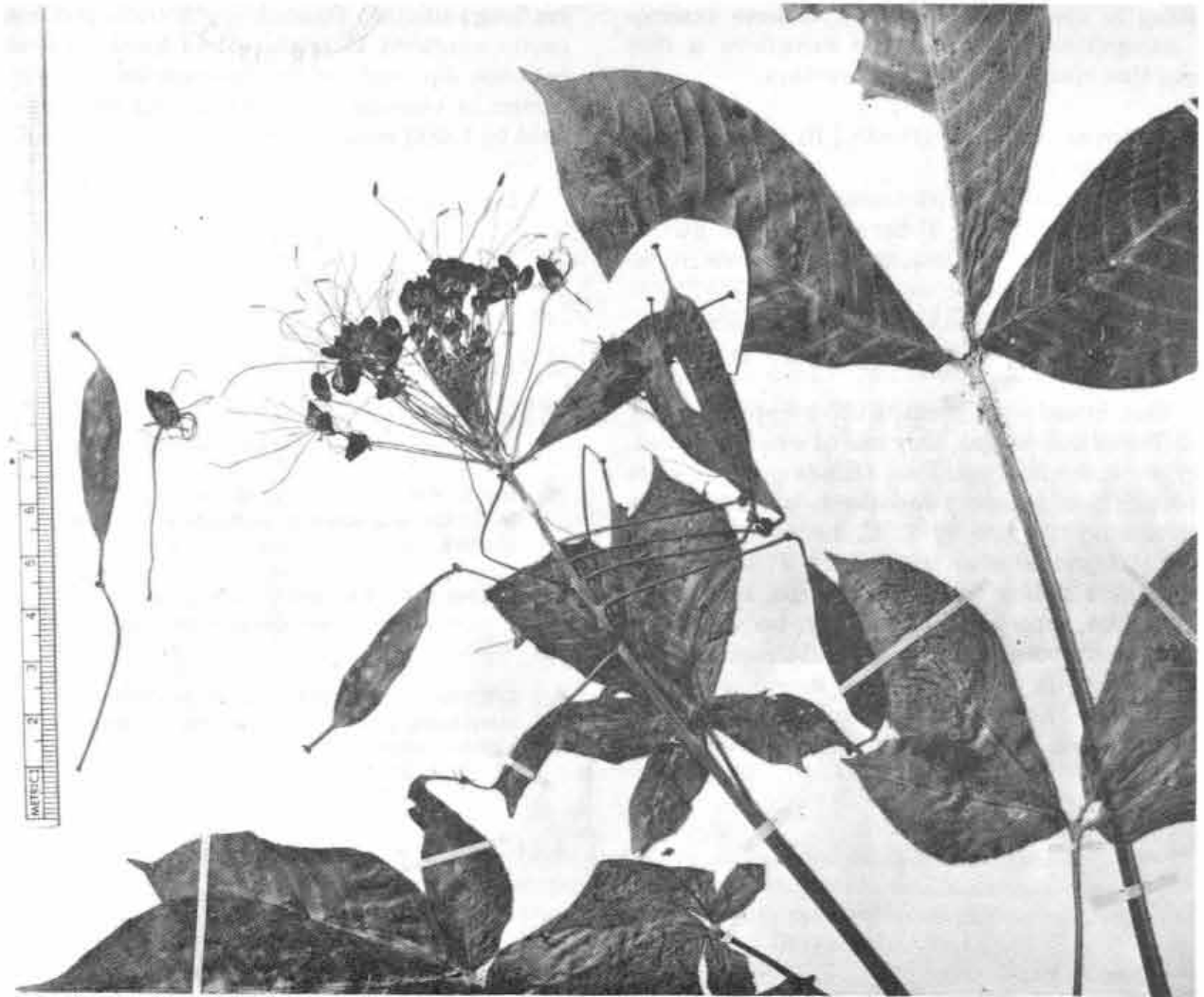
FIGURA No. 3

Podandroyne colombiana . Portion of stem and leaves plus an inflorescence bearing staminate flowers toward the tip and immature fruits toward the base. (Killip 34848, US-sheet 1.)