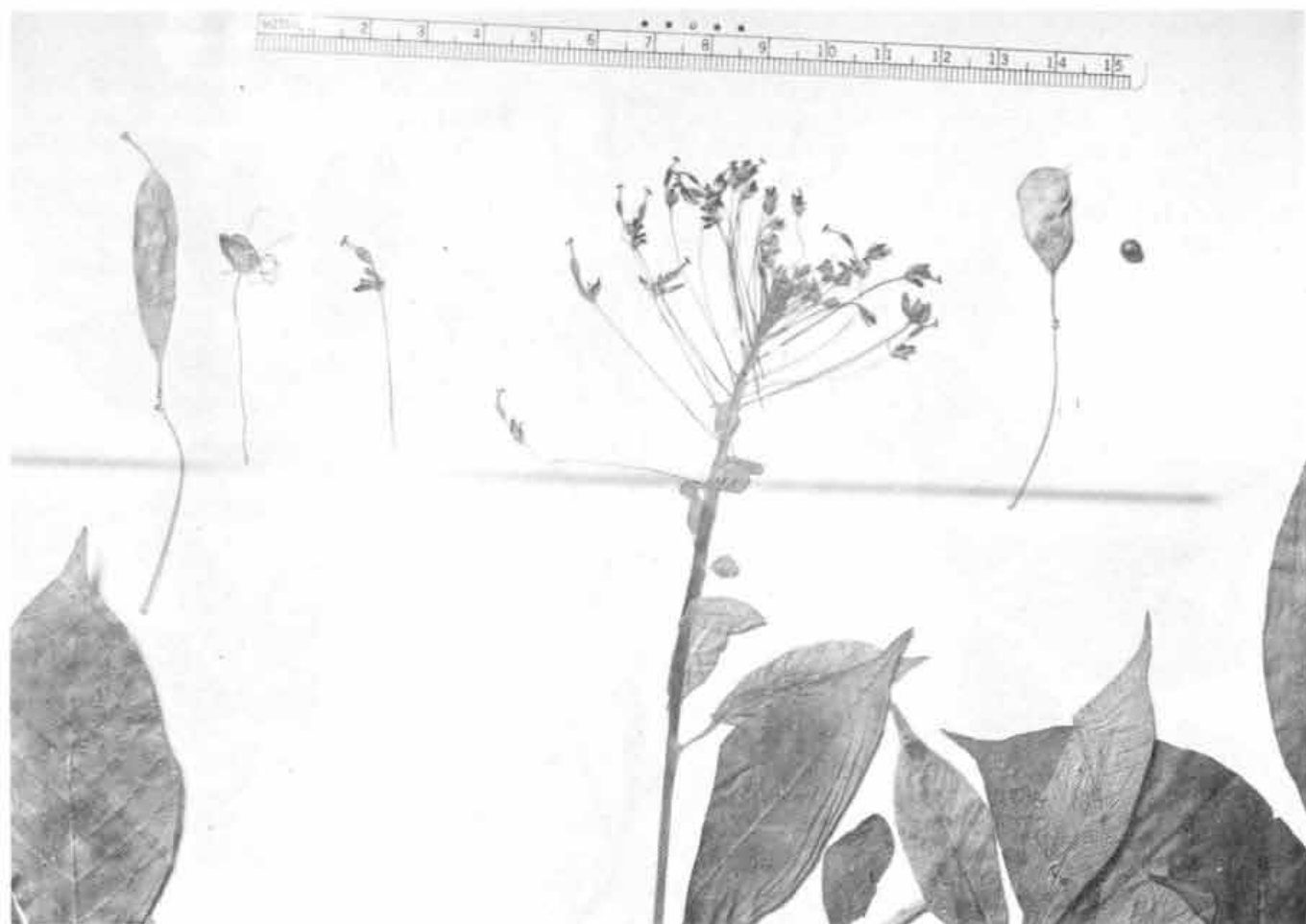
FIGURA No. 2

Podandrogyné colombiana . Upper portion of plant, showing inflorescence in pistillate phase. (Enlargement of Figure 1).