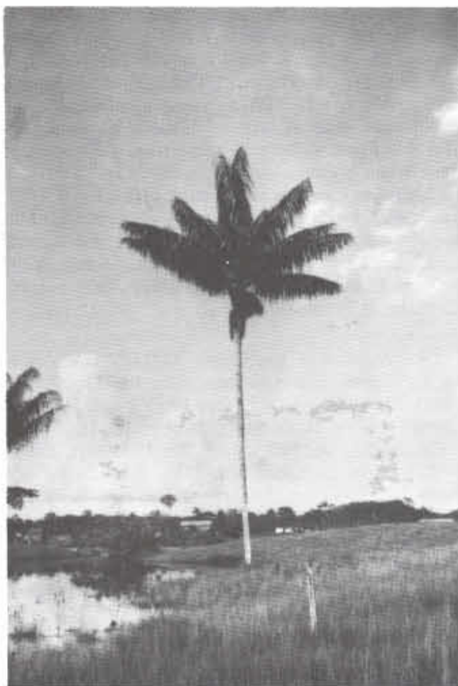
FIGURE 2. Oenocarpus bacaba in the Vaupés.

Trunk large, solitary, columnar, 8-20 (-25) m high, (12-) 15-25 cm diam. Leaves 7-17 per coma, robust, spirally arranged, fewer in younger or senescent plants; sheath ca. 0.75-1.10 m long, outer surface dull olive-green, inner surface glabrous, upper margins lined with straw-like, brown, flexible