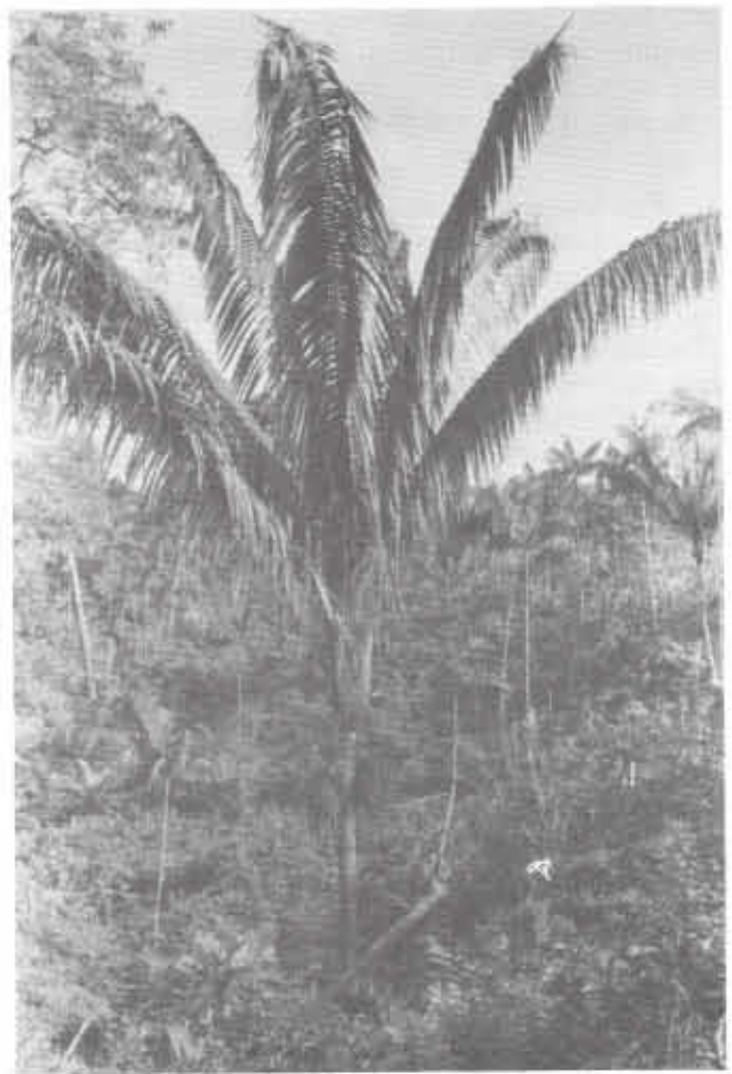
FIGURE 6. Jessenia bataua in the Chocó.