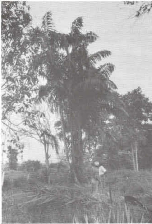
FIGURE 4. Oenocarpus mapora subsp. dryanderae on the Pacific Coast.

Distribution. A widespread species occurring in Costa Rica, Panama, and throughout much of the northern half of South America, up to an altitude of about 1000 m.