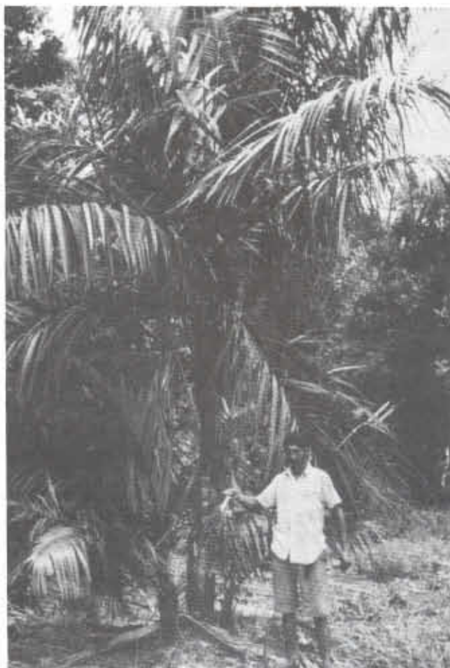
FIGURE 3. Oenocarpus mapora subsp. mapora in the Llanos.

Trunks caespitose, growing 6-12 together or solitary. Pinnae generally devoid of trichomes between the intermediate veins abaxially, or if trichomes present, these mostly simple and bristle-like and appressed to the lamina, or else on the intermediate veins. Fruit ellipsoid to subovoid, variable in size, 1.8-2.5 cm long (not including cupule), 1.4-2.0 cm wide; cupule 5-6 mm deep, 9.16 mm wide.